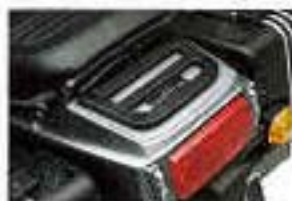
Integral hooks let you strap gear on the hideaway rack in seconds.