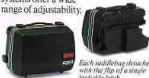
Each saddlebag detaches with the flip of a single lockable latch.